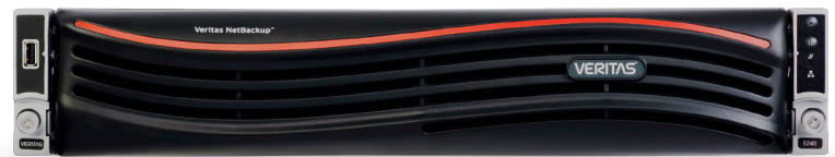
Figure 2. Veritas NetBackup™ 5240 is an integrated enterprise backup appliance with expandable storage and intelligent deduplication.