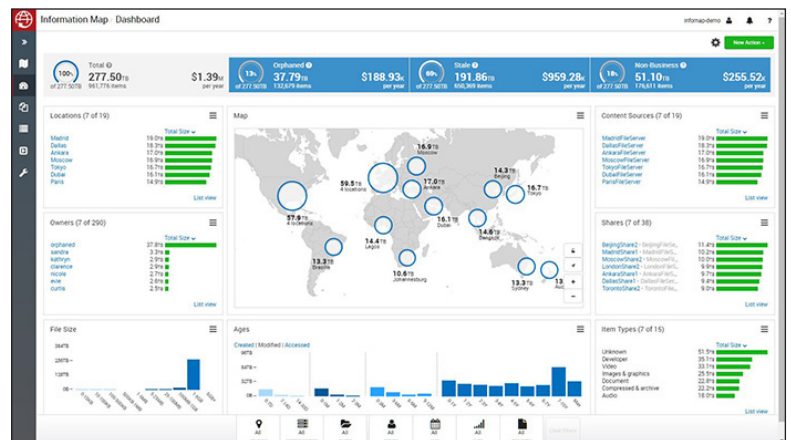
Figure 4. Veritas Information Map renders your information environment in visual context and guides users towards unbiased, information-governance decision making.